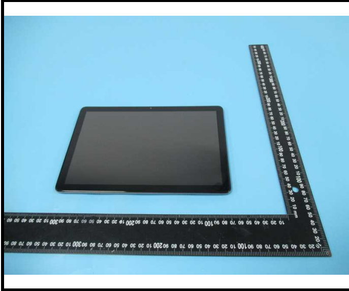
Photograph of Sample